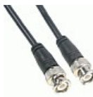
BNC Male to BNC Male (...) ★★★★★(12)