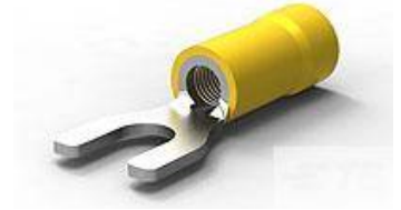
TE Part # 8-34176-1 TERMINAL, PG SPD 12-10 10