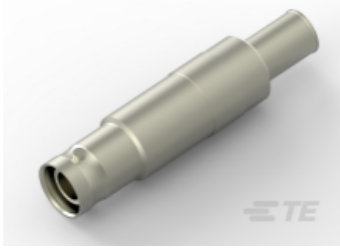
TE Part # 225087-5 SHV JACK