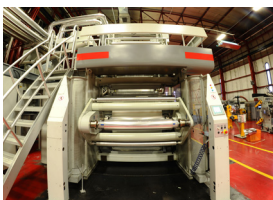
INDUSTRIAL EQUIPMENT AND MACHINERY