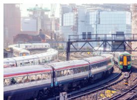
ROLLING STOCK AND RAIL INFRASTRUCTURE