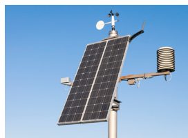
SENSORS AND TESTING EQUIPMENT