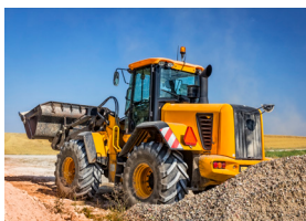
HEAVY AND OFF-ROAD VEHICLES