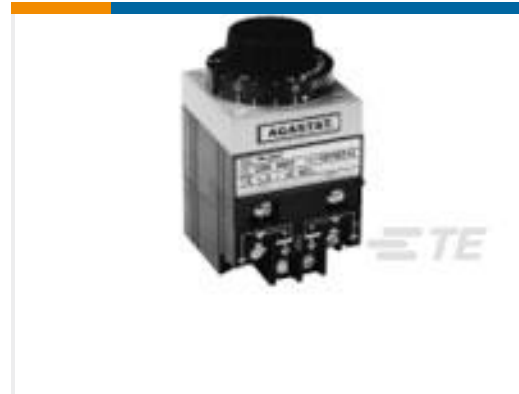
TE Part #6-1755142-4 7022WDIM=RLY,STD,OFF,2P,96V,50S,I, M