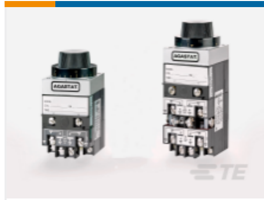
TE Part #1755170-1 7022OCIM=RLY,STD,OFF,2P,24V,15S,I, M