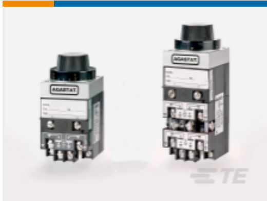
TE Part #7-1472995-0 7012WDS=RLY,STD,ON,2P,96V,50S,S