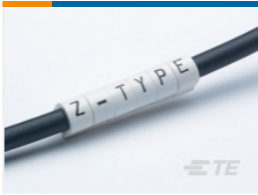
TE Part #EC0437-000 06153411