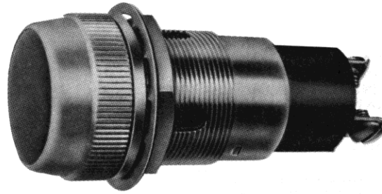
104-3101-0211-403 Flat lens