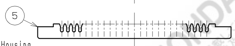
Discrete Cable Housing