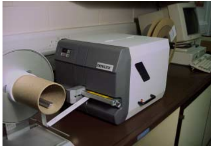
TMS 2000Plus in-line thermal transfer printer