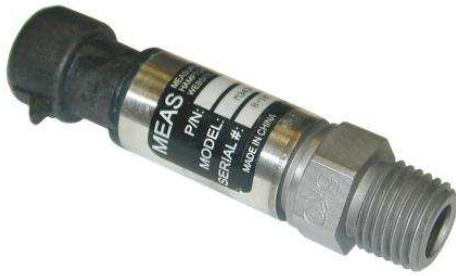
Shown with Packard Connector